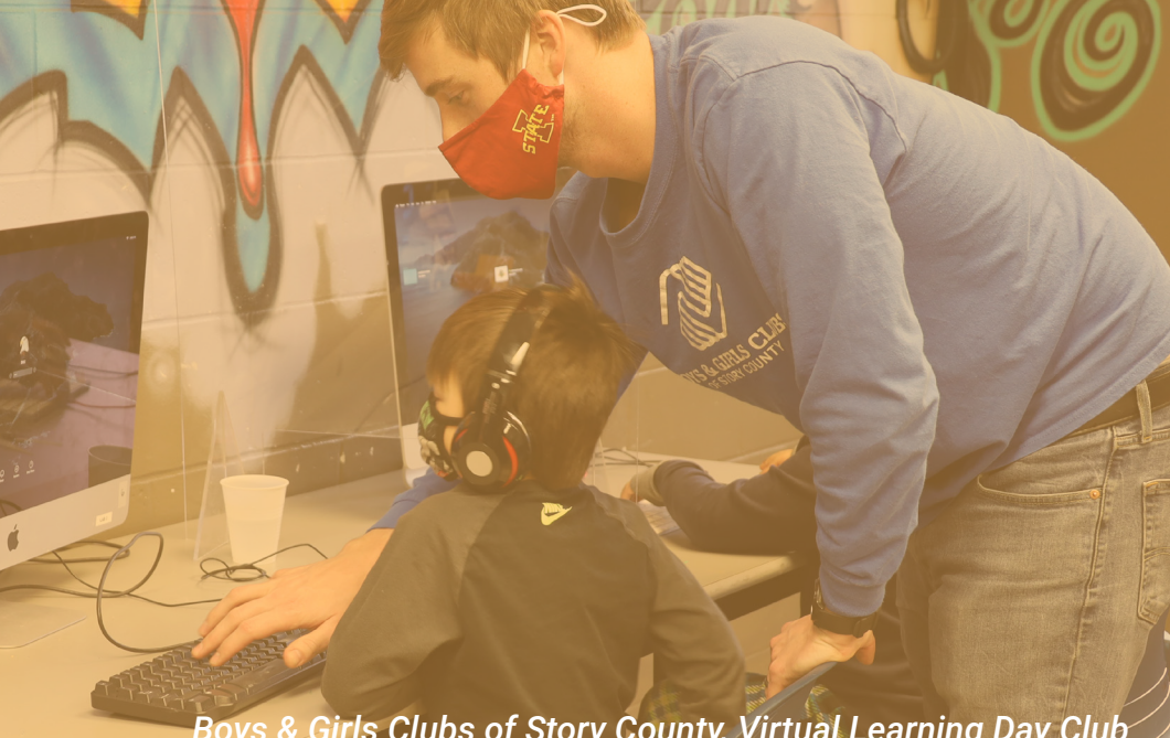
oys & Girls Clubs of Story County, Virtual Learning Day Club

Decrease the achievement gap by reaching 30% more underserved learners by 2025